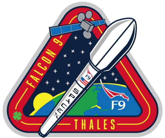
Official SpaceX Thales mission patch.