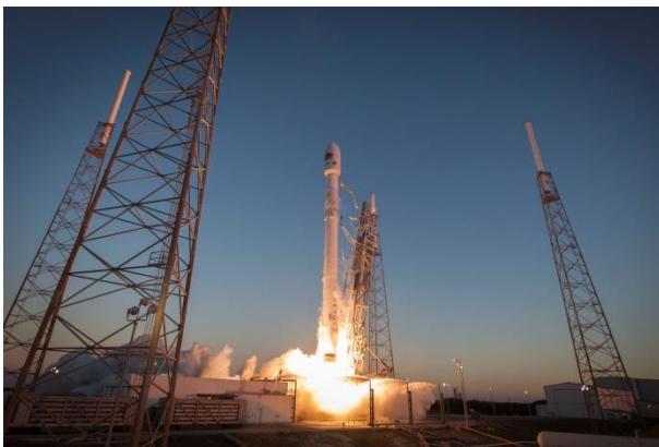
A Falcon 9 rocket launches from SpaceX's launch site at Cape Canaveral Air Force Station, Fla.

SpaceX's Space Launch Complex 40 at Cape Canaveral Air Force Station is a world-class launch site that builds on strong heritage: the site at the north end of the Cape was used for many years to launch Titan rockets, among the most powerful rockets in the US fleet. SpaceX took over the facility in May 2008 and has since launched from the site 16 times.